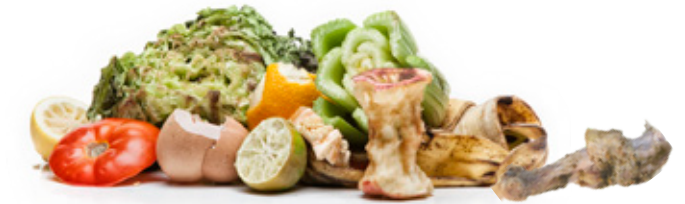
Food Scraps, Including Egg Shells, Meat & Bones

UPDATED: No coated paper (with surface sheen) such as cups, plates or cardboard boxes. No "compostable" plastics.