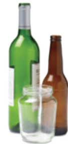
Glass Bottles & Jars (Even broken)