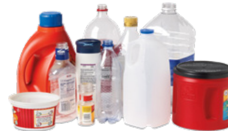
Empty Plastic Bottles, Rigid Plastic Containers (Lids should be left on or placed in trash)

Have a question about where you can recycle an item? Check out www.recyclewhere.org or call Stopwaste's Recycle Hotline at 1-877-STOPWASTE.