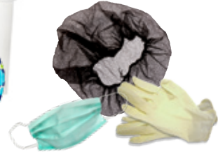
Disposable Gloves & Hairnets