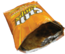
Snack & Chip Bags, Candy Wrappers

UPDATED: Coated paper (with surface sheen) such as cups, plates or cardboard boxes, belong in trash only. (Paper beverage cartons may go into recycling)