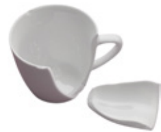
Broken Glass & Dishes (Please Wrap)