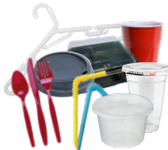
Plastic Cups & Lids, Utensils, Straws, Clam Shells, Deli Containers & Hangers (Including "compostable" plastic serveware)