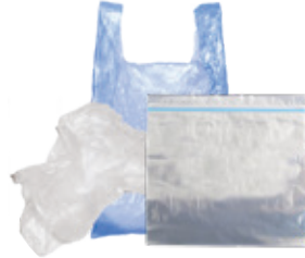
Plastic Wrap, Bags & Other Plastic Film