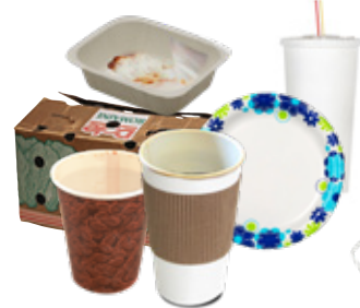
Coated Paper Cups/Plates, To Go Containers, Wax-lined Food Cardboard Boxes