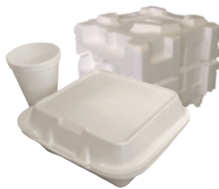
Polystyrene Foam & Packaging