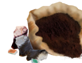
Coffee Grounds & Tea Bags