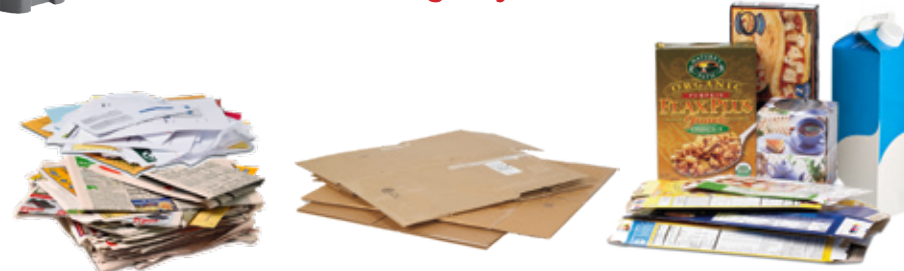
Clean Paper, Magazines, Newspaper, Cardboard, Junk Mail, Paper Beverage Cartons (no other coated paper items)

Please empty all containers prior to recycling. Do not bag recyclables.