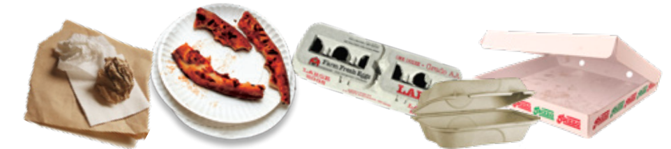
Food Soiled Paper, Napkins, Paper Towels, Pizza Boxes, Cardboard Egg Cartons, Non-coated Take-out Containers & Paper Plates (No surface sheen)