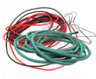
Hoses, Cords & Wire (Electrical wires are e-waste. Refer to Hazardous Waste Disposal Information)