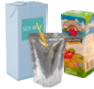
Asceptic (Mixed Material) Drink & Beverage Cartons, Boxes & Drink Pouches