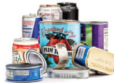
All Metal Beverage & Food Cans, Empty Aerosol Cans, Clean Aluminum Pans & Foil