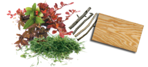
Yard Waste, Untreated Wood