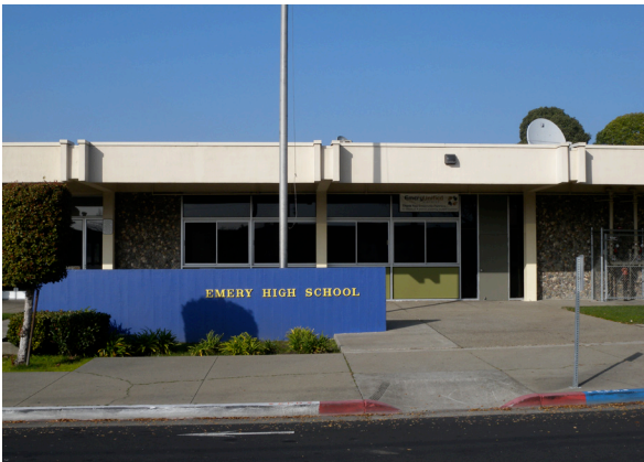
The Emery public schools are Annie Yates Elementary (top) and Emery Secondary (bottom). These schools will be consolidated and integrated into the Emeryville Center of Community Life.