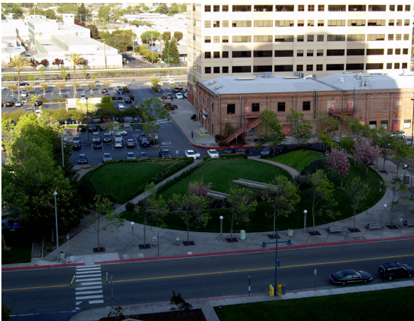
Park siting is essential to avoid shading by tall buildings (above).

Although the amount of parkland is an essential component to creating a vital network of open spaces, the quality and accessibility of these spaces are equally important elements. A city should have parks with a distribution and form that allows them to be enjoyed by workers during the day, used by children and senior citizens close to their homes, and to serve as a point of focus for residential neighborhoods. The General Plan seeks to provide a network in which there is an open space accessible within a five-minute walk of each resident's home. To achieve this goal, generalized park locations have been identified throughout the city, where a deficit has been noted within existing and proposed neighborhoods.