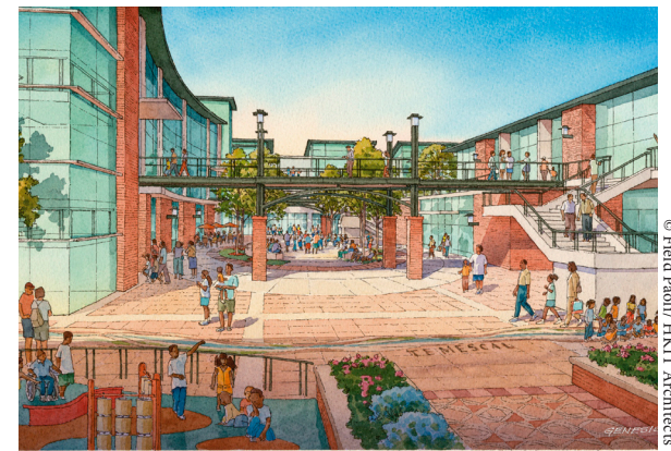
Concepts for the proposed Emeryville Center of Community Life.