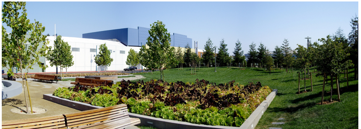
New open spaces will include areas for active recreation as well as facilities for passive activities and contemplation.