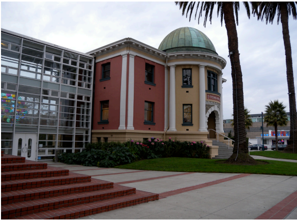
The City's public services are essential to maintaining a high quality of life for residents. Municipal services are consolidated in City Hall.