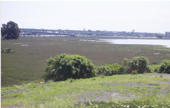
The General Plan proposes several new open spaces, complementing existing parks, and providing new open space opportunities for existing and future residents.

They also serve as important gathering places in a community. Due to its industrial past, Emeryville has minimal parks and open space. Public facilities and services provide for community needs and amenities for education, social services, and public safety. As the residential and employment populations increase, it is essential to seize every opportunity to create additional parks and open space, and to provide public facilities and services that meet the needs of the community.