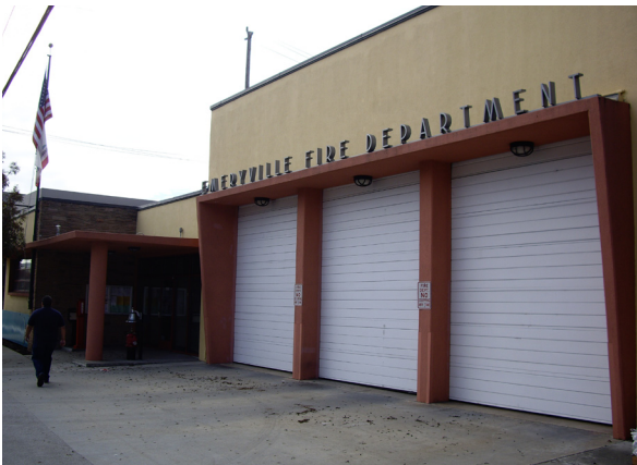
The Fire Department responds to emergency calls but also maintains the City's emergency management plan.

The department receives an average of 1,500 calls each year, which includes mutual aid responses to nearby cities. The State requires a minimum response time of eight minutes to emergency calls. The EFD averages just under five minutes time from the inception of an emergency call to their arrival on the scene. Overall, about 60 to 65 percent of the department's calls are medical, with Station #2 handling around 60 percent of all non-fire calls.