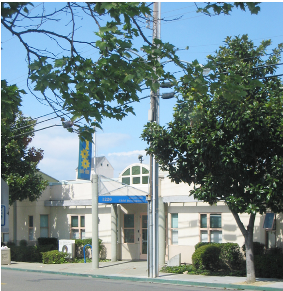
The Emeryville Child Development Center provides market rate and subsidized child care services.

nity. Through several years of public meetings, the Emeryville community has also identified key themes to incorporate into the Center: connections to the community; access to facilities and programs; active engagement of the community in these programs, and the expression of an identity for Emeryville.