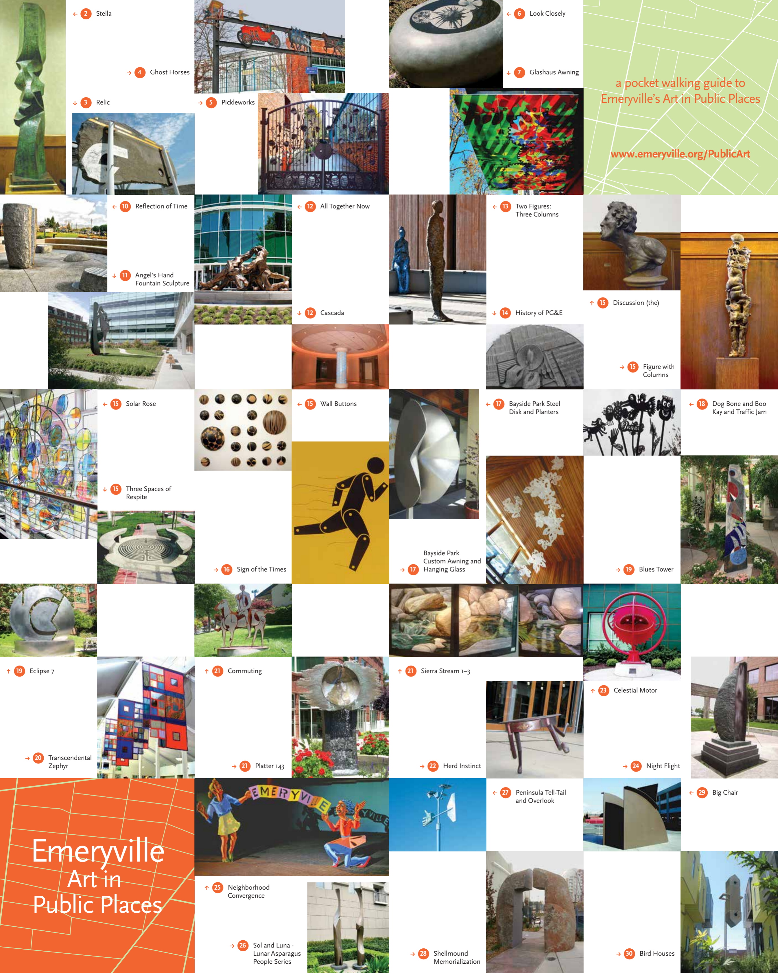
← 2 Stella