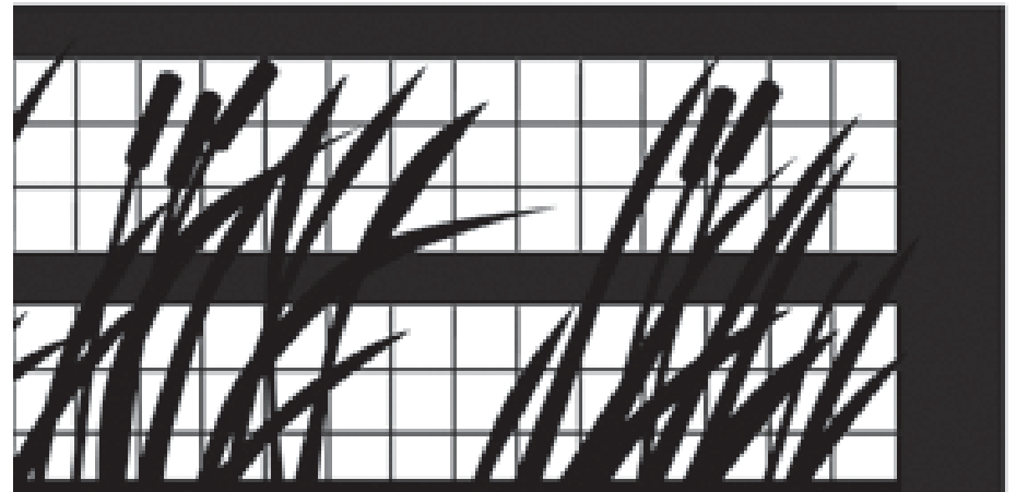
ART FENCING FOR PLAY AREA

ARCATA BENCH BY LANDSCAPEFORMS MADE WITH POLYSITE SEAT 92% RECYCLED CONTENT